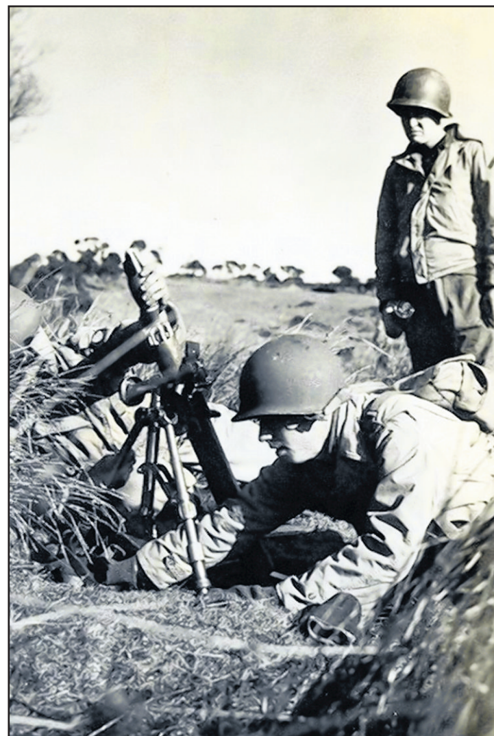
505th Parachute Infantry Regiment troopers fire a mortar on the range at Ballymultrea, near Ballyronan, February 1944.